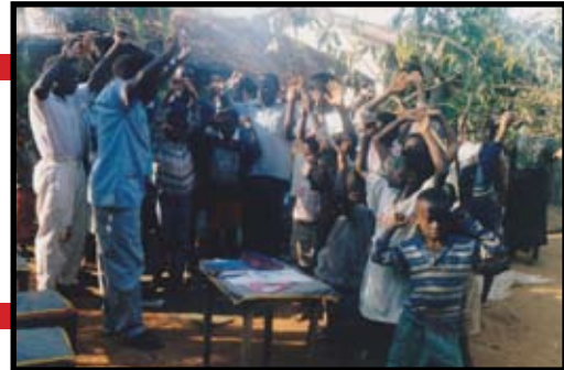
Bible Study with new Christians.